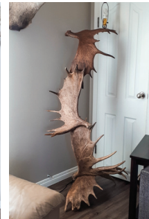
1 moose horn floor lamp $995.00