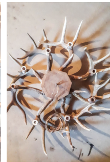
1 single-tiered WT chandelier $750.00