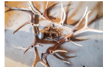
2 triangular elk horn chandeliers $500.00